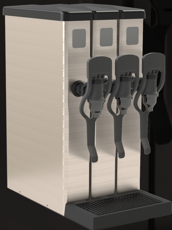
Taprite Ambient Towers