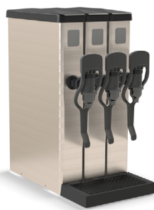
3-Valve | Part# 9250035