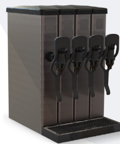
4-Valve | Part# 9250037