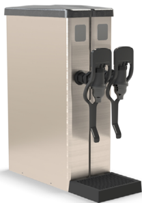
2-Valve | Part# 9250036